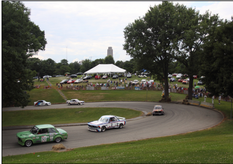
At the Pittsburgh Grand Prix, you'll see old-school road racing at Schenley Park.

You won't want to miss the annual BMW Gathering at the Pittsburgh Vintage Grand Prix (PVGP) scheduled for July 16–25 and sponsored by Liberty Mutual Insurance and the BMW CCA.