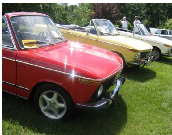
Vintage at the Vineyards brings many BMWs—and BMW enthusiasts—to North Carolina.

The host hotel is the Hampton Inn in Dobson. Friday features the BMW CCA Foundation-sponsored barbecue. Saturday's activities include scenic drives, wine tasting, hayrides, a live rockabilly band, and more, all at the beautiful Shelton Vineyards. For more info and a link to registration, please visit www.vintageatthevineyard.com