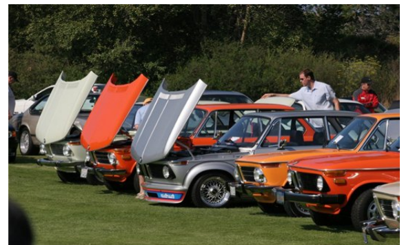
This year the BMW CCA West Coast Summer Concours has been expanded, with Porsche and Mercedes-Benz joining us in Monterey.

This event will be limited to marque-club members only. Space will be limited to 200 BMWs, 100 Porsches, and 50 Mercedes-Benz, and will include a