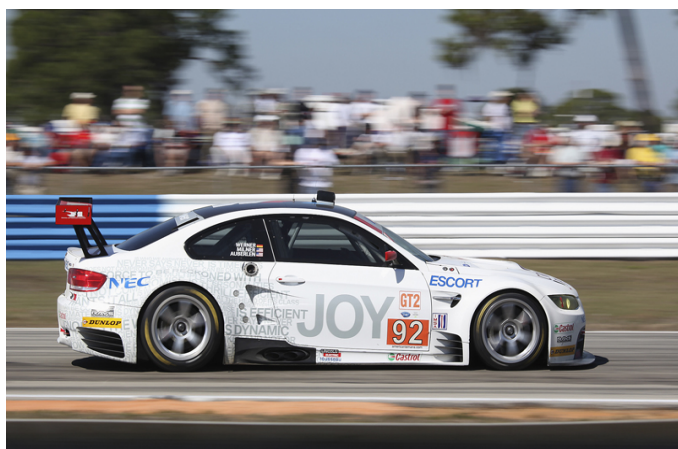
Joy is definitely in the picture when the BMW-Rahal Letterman race cars come to California.

It's a great year for BMW racing fans, with the BMW-Rahal Letterman M3s potent contenders for victory at every race. You can help root BMW on to victory at the ALMS race at Laguna Seca in May—not October, as in past years. With the Le Mans prototypes and GT machines of the American Le Mans Series staging a Saturday afternoon-into-evening six-hour race, our BMW CCA corral will be the place to watch all the action!