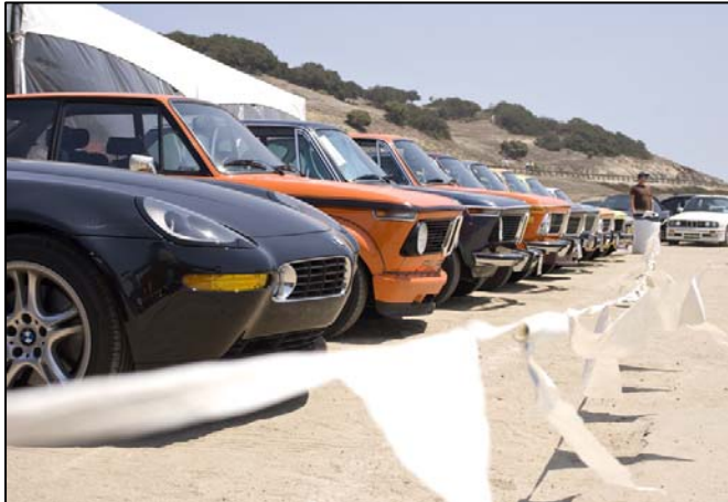
The historic races at Monterey always draw a huge BMW crowd to watch the action above Turn Five. (Jeff Cowan)

Also sponsored by Liberty Mutual Insurance and the BMW CCA, the annual the BMW CCA