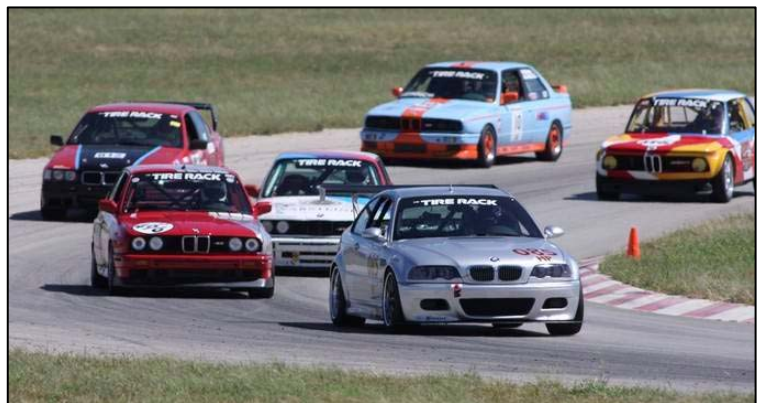
Club Racing has become a popular O'Fest event.