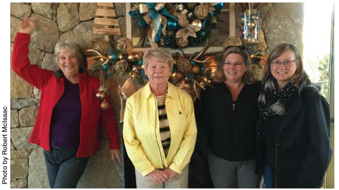
The last Friday of the year and the Raleigh folks gather for a completely unplanned lunch event!