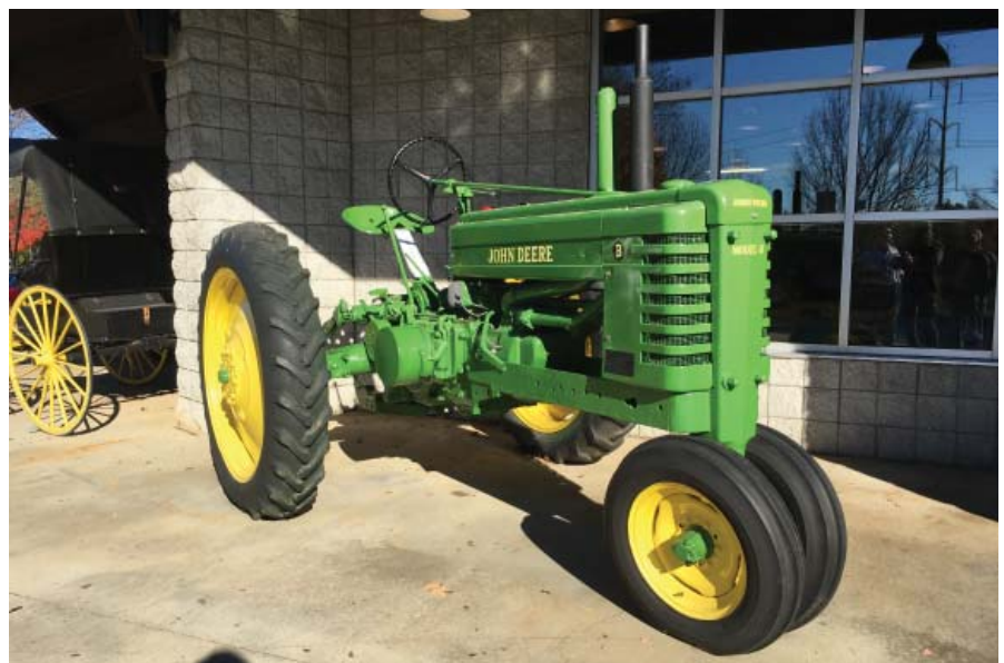
And now for something completely different... Bimmers, Beemers and John Deere, Farmer's Market restaurant in Raleigh.

The Z-Series Car Club of America (ZSCCA) is a national special interest group of BMW-CCA dedicated to the enjoyment of all Z-Series BMW's. Several local groups are active in VA and NC. Find us on Facebook, or at zscca.org