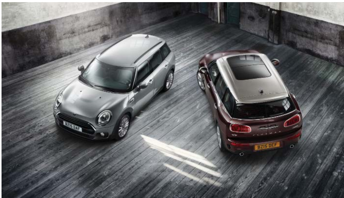
The new MINI Clubman.