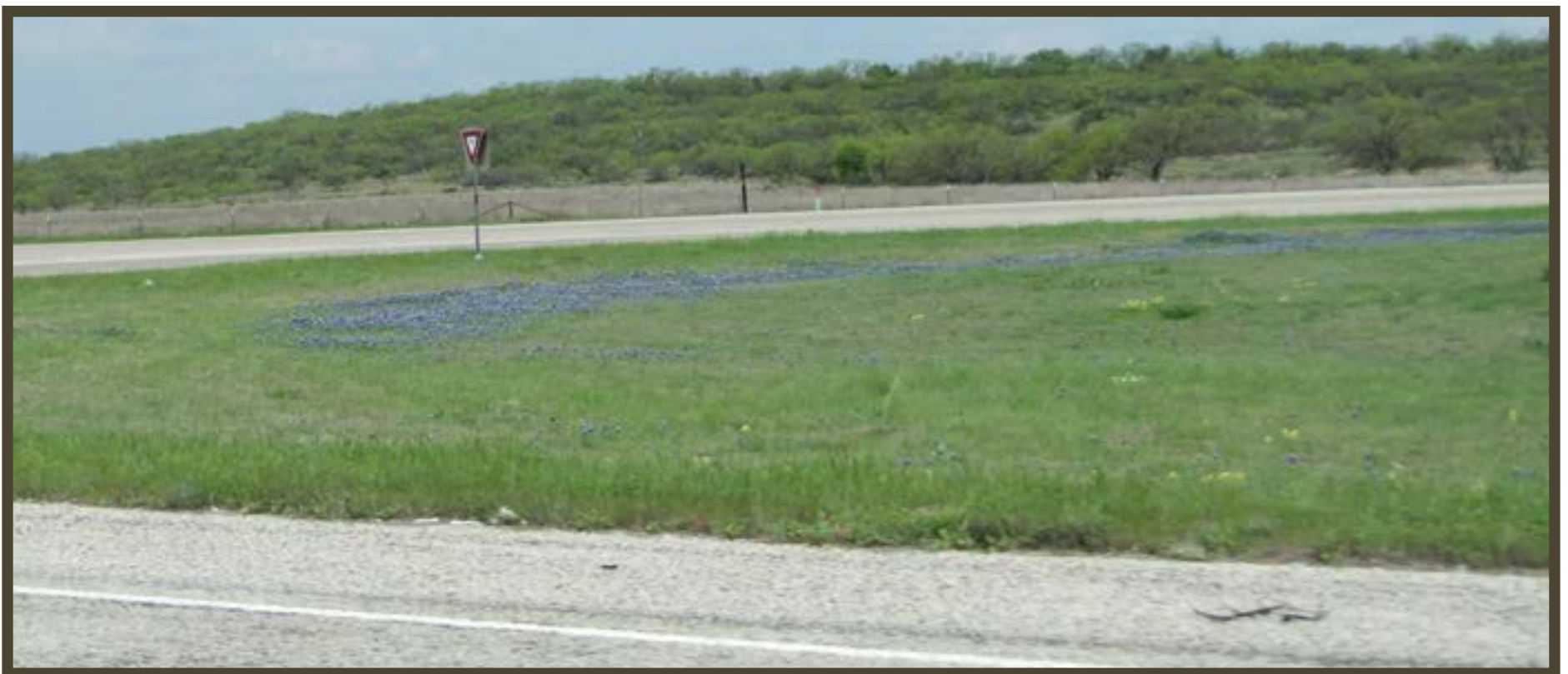
North Texas wildflowers; normal, North Texas bluemomnets.

As we headed west from Marathon, suddenly things got really pretty. It seemed like every time we crested a hill, there was a change to the topography and another amazing view.