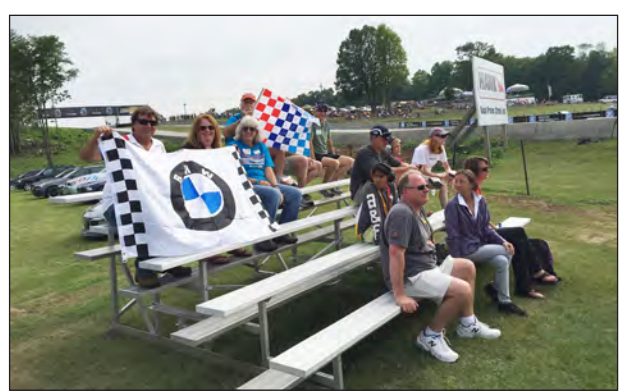
The corral crew