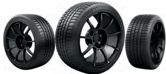
MICHELIN® Pilot® Sport A/S 3

324 West Cherry Street Milwaukee, Wisconsin 53212 414.273.1000