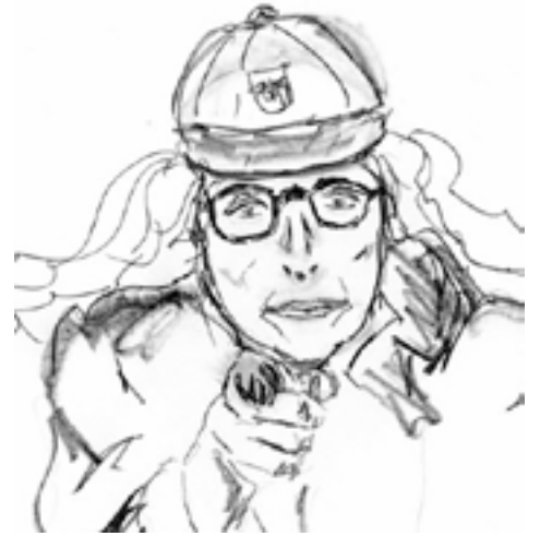
With acknowledgement to James Montgomery Flagg who created the original 1917 Uncle Sam recruitment poster.

To keep up on planned events, there's a calendar listing on every web page which shows the next five items on our schedule. However, did you know you can view all upcoming activities from the navigation at the top of the page? Select Chapter Info; the last item on the drop-down is List All Chapter Events. By using this link you can keep up with everything organized for the year.