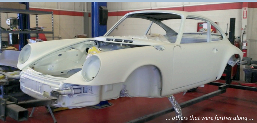
... others that were further along ...