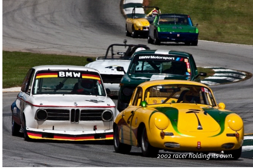
2002 racer holding its own.

A local group, Zapata Racing, has produced a very well done documentary called Vintage Racing Today. A short clip is available on YouTube if you want to see what all the fuss is about. https://youtu.be/Nll6nK5_qIY .