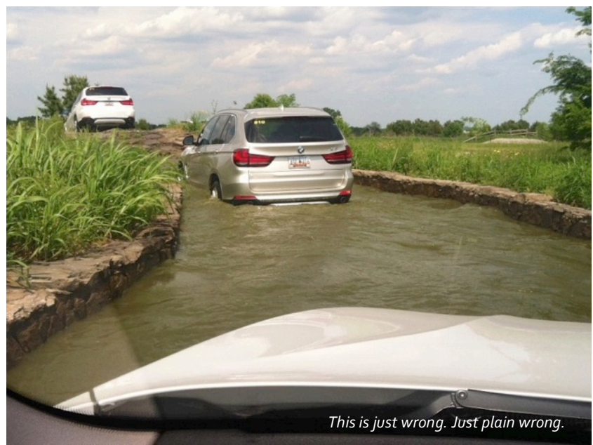
This is just wrong. Just plain wrong.