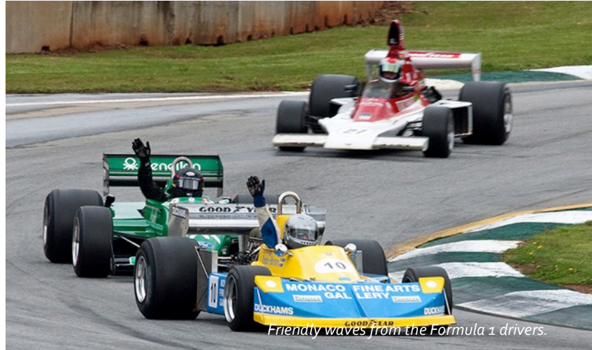
Friendly waves from the Formula 1 drivers.