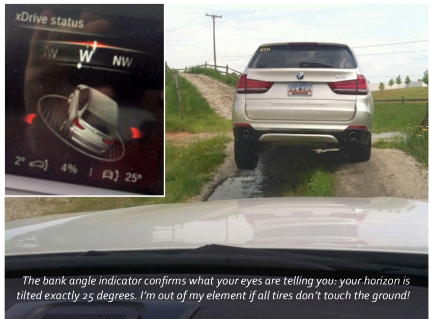
The bank angle indicator confirms what your eyes are telling you: your horizon is tilted exactly 25 degrees. I'm out of my element if all tires don't touch the ground!