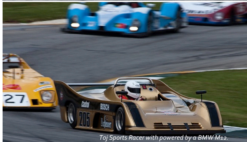
Toj Sports Racer with powered by a BMW M12.