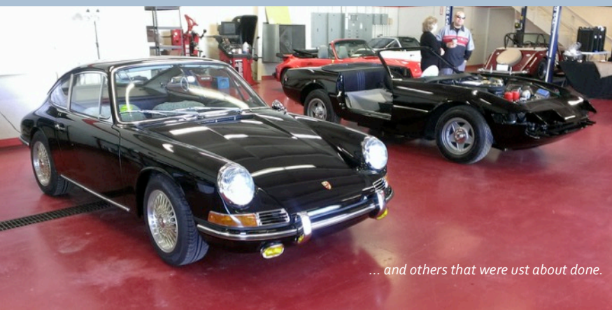
... and others that were ust about done.