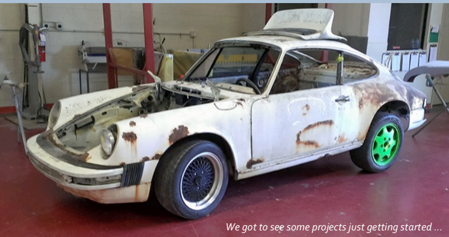
We got to see some projects just getting started ...