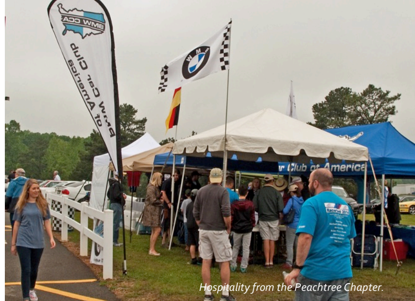
Hospitality from the Peachtree Chapter.