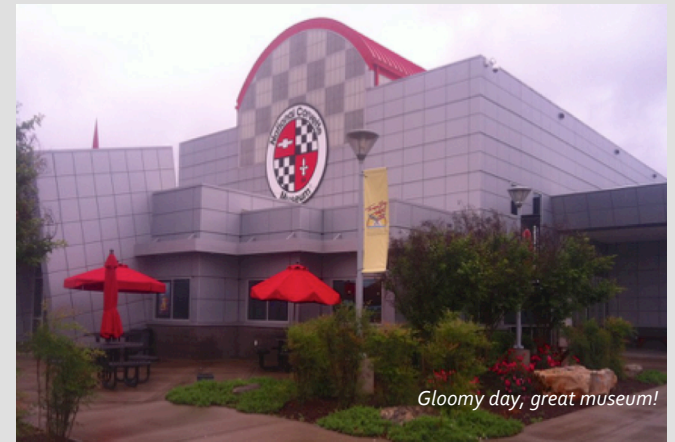
Gloomy day, great museum!