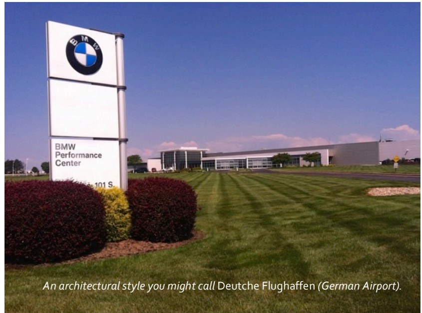
An architectural style you might call Deutsche Flughaffen (German Airport).

www.bmwusa.com/performancecenter-overview