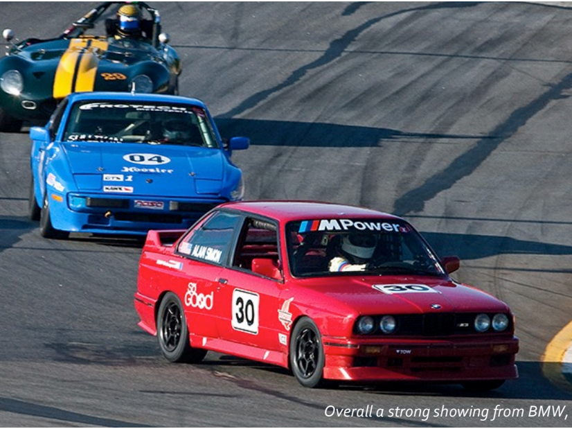
Overall a strong showing from BMW,