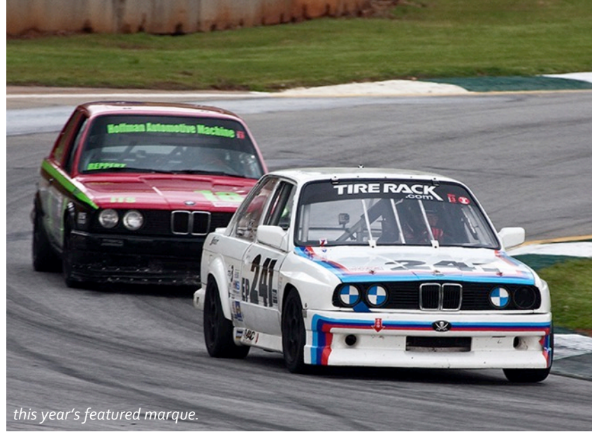
this year's featured marque.

This 2002 turned out to be a veteran of the 1970 Trans-Am season. The Mitty is where these classic racers show they've still got it.