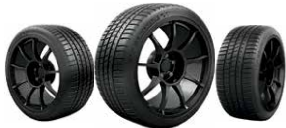
MICHELIN® Pilot® Sport A/S 3

324 West Cherry Street Milwaukee, Wisconsin 53212 414.273.1000