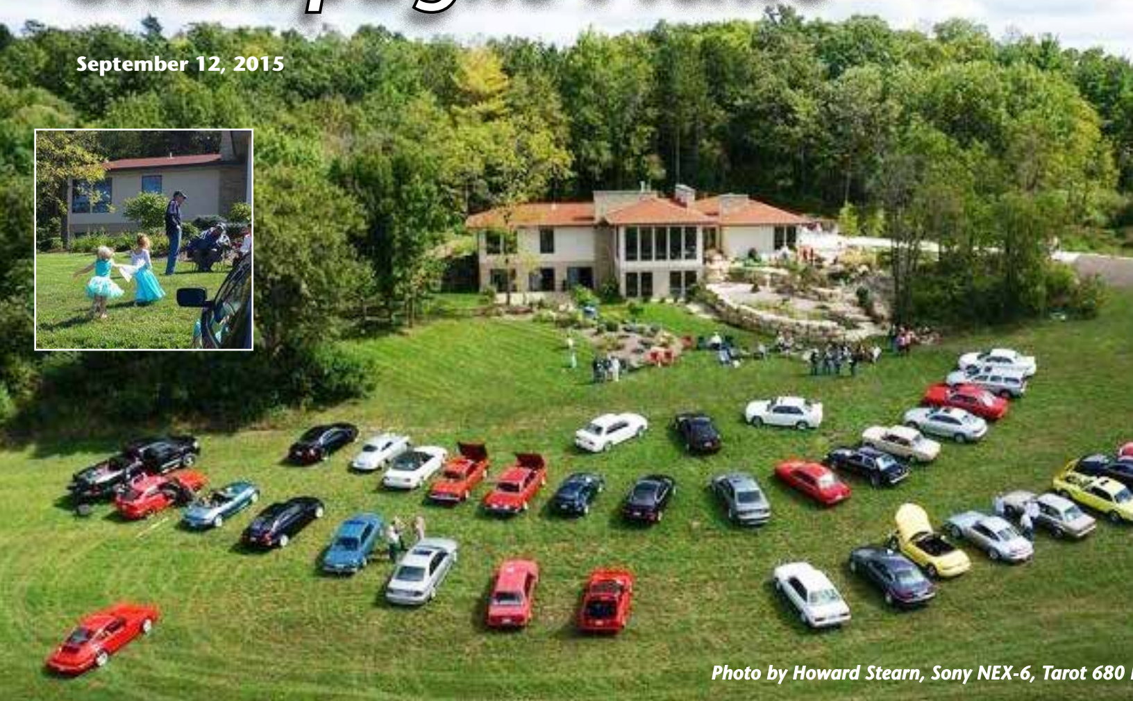
Sony NEX-6, Tarot 680