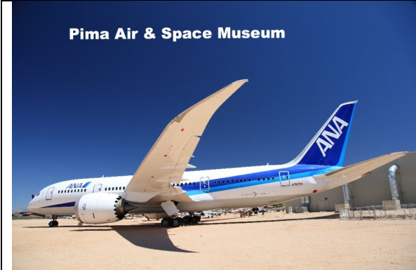
Pima Air & Space Museum

Pima Air & Space Museum - Joining forces with the Tucson Chapter at the largest private air museum in the world, we had a great day! Highlights: SR71-Blackbird, B-17 Flying Fortress, Boeing 777 Dreamliner test version. A number of displays are air conditioned! Afterwards, we all met for lunch. Some of us even had the energy to blast back up SR79 to Phoenix!