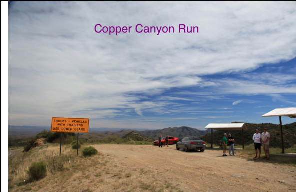
Copper Canyon Run

Pima Air & Space Museum - Joining forces with the Tucson Chapter at the largest private air museum in the world, we had a great day! Highlights: SR71-Blackbird, B-17 Flying Fortress, Boeing 777 Dreamliner test version. A number of displays are air conditioned! Afterwards, we all met for lunch. Some of us even had the energy to blast back up SR79 to Phoenix!