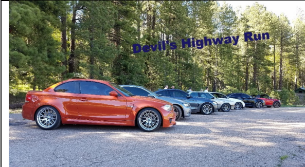
Devil's Highway Run

The Copper Canyon Run is a great run, just east of the Valley, with plenty of fast sweepers and apexes. Chris Finlay led the charge through Winkelman and out to Globe, where everyone stopped for lunch before heading back.