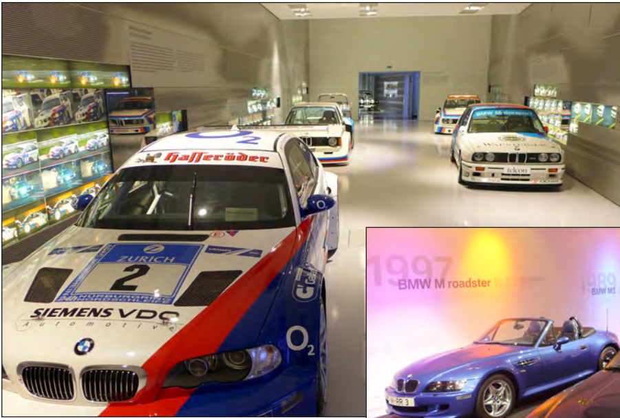
The Hall of Race Cars