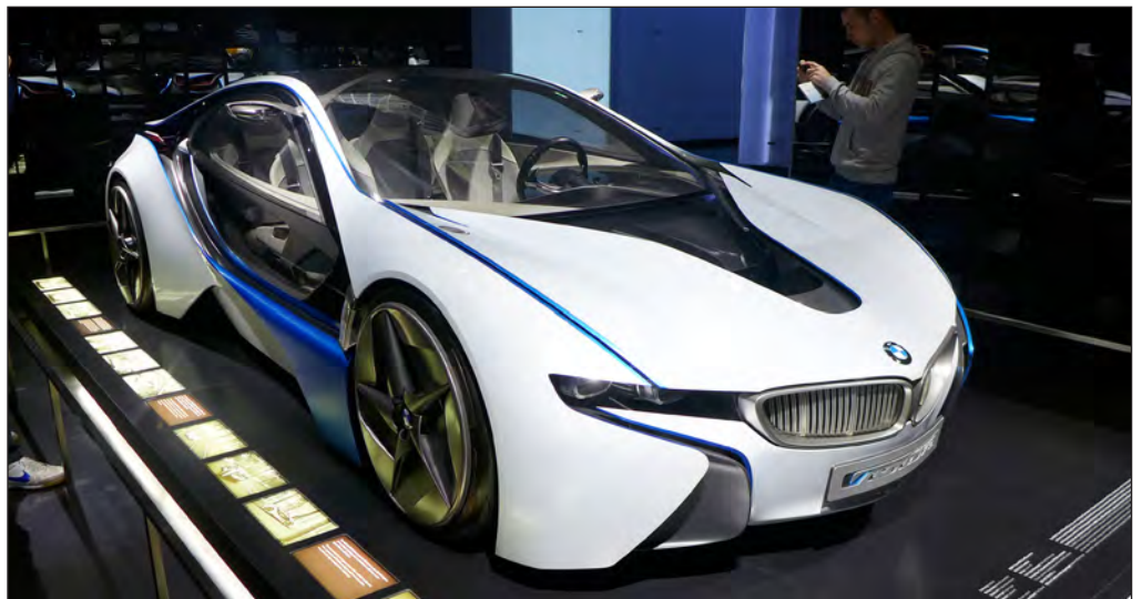
The 2009 I8 Prototype