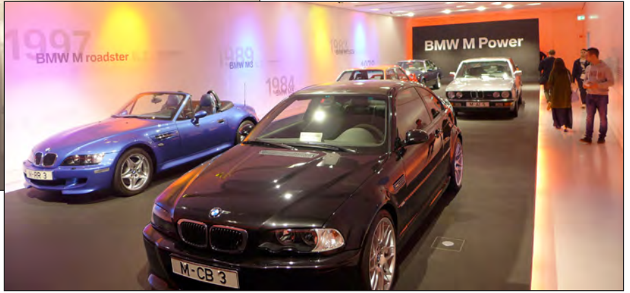
The Hall of M Cars