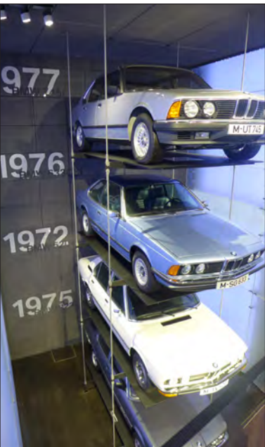
The '70s vertical stack

layout. Multiple floors and bridges were in view. We passed by a vertical stack of 1970s 7-, 6-, 5- and 3-series and continued into the 3-series hall showing its development from the '70s through the 2000's E46. We continued into the Hall of M cars starting with the 1981 M1 through the E46M3 SLC. As we passed over bridges, each bridge provided a different view of the lower levels. We passed several individual displays of special cars: an Isetta, BMW 700, 2009 I8 prototype, 328 Mille Miglia Roadster, which was a major design statement moving into aerodynamic design, and finally a clay model cut-away to show how the clay models are built. We worked our way down to the lower level which displayed classic roadsters: 1930 3/15PS, 1934 315/1, 1936 328 and the 1956 507.