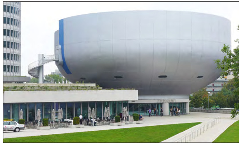
The BMW Museum

This led us into automotive racing history, which started with a 1939 328 fixed-roof racing saloon made with tubular frame and an aluminum skin. Adjacent to this early racer was the B52 F1 race car. This was driven by