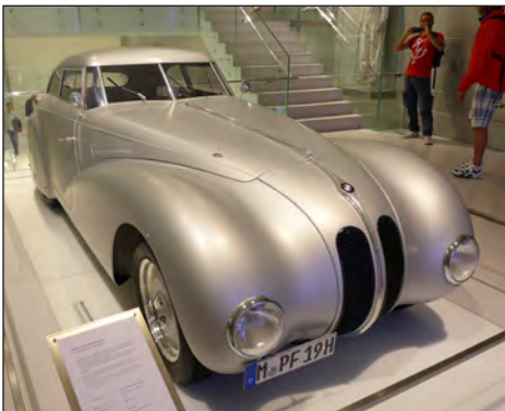
The 328 Fixed-roof Saloon

history displays that included the Bayerische Motoren Werke GmbH 1917 six-cylinder airplane motor and other early production items. Moving along, we passed the motorcycle display of racing and production cycles.