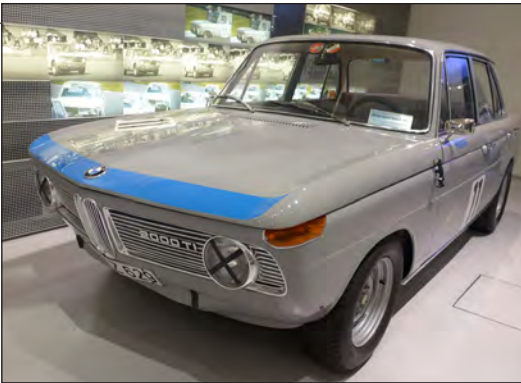
The 2000 TI Sport Racer