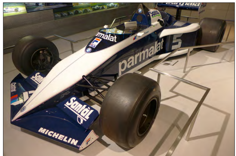
The B52 Formula 1 car

Crossing the first bridge provided a good view of the museum