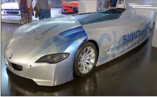
The hydrogen-powered HR2