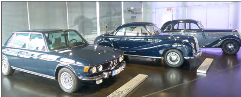
In the lobby

As we entered the lobby, we were greeted by three, what I assumed to be, classic vehicles—none of which I have ever seen before: 1939 335, 1954 502 and a 1968 3.3LI. Our tour started with the early