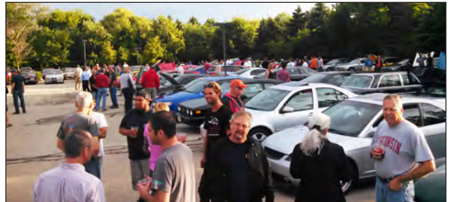
Bimmer Cruise Night 2015

Be sure to put this event in your calendar, it's going to be a highlight of your summer!