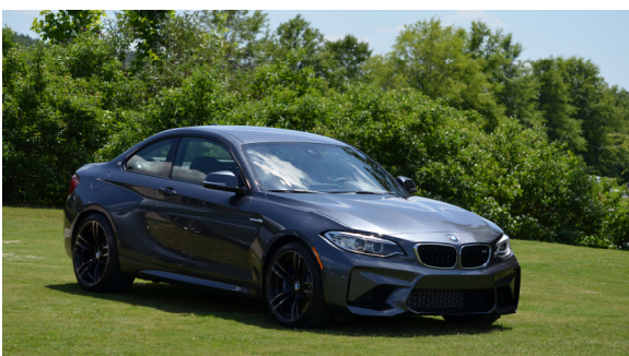
Our HoD Chapter participated both Saturday and Sunday with the club corral, parade laps and designate BMW viewing tent. Amazing weather!