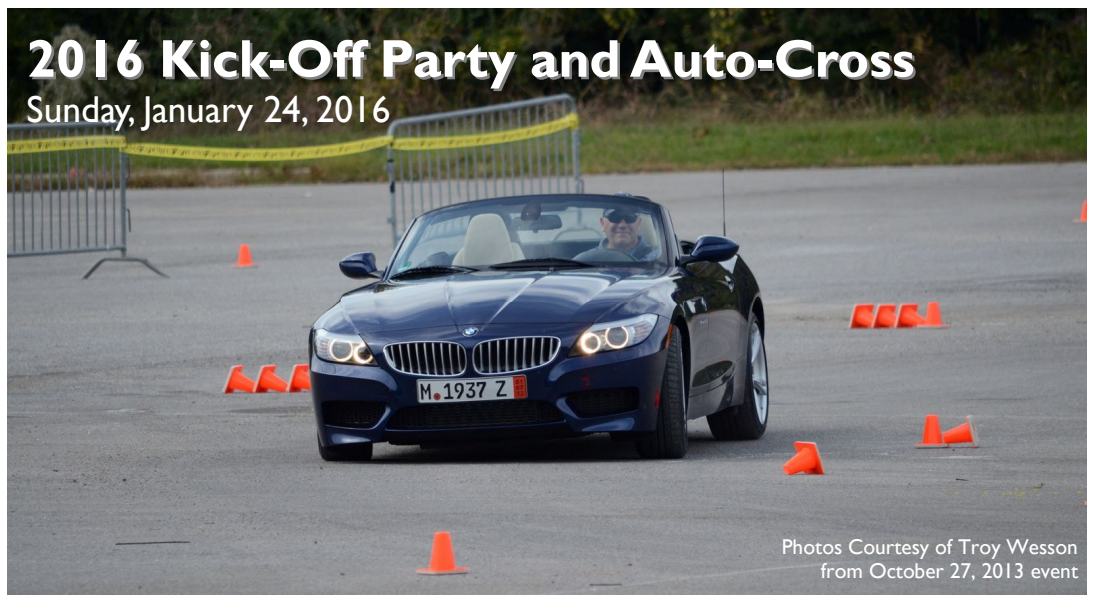
from October 27, 2013 event