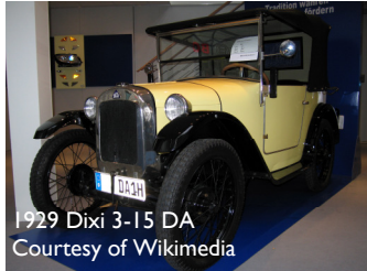
1929 Dixi 3-15 DA

Did you know the first BMW was the Dixi? The Dixi was licensed from the Austin Motor Company in 1927 as a left-hand drive variant of the Austin 7 to the Automobilwerk Eisenach company. In 1928, BMW, looking to get into the automobile business, purchased Automobilwerk Eisenach. Variants of the Dixi continued in production with BMW until 1932.