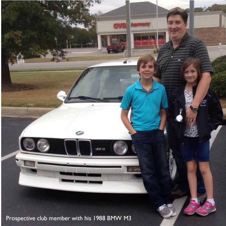
Prospective club member with his 1988 BMW M3