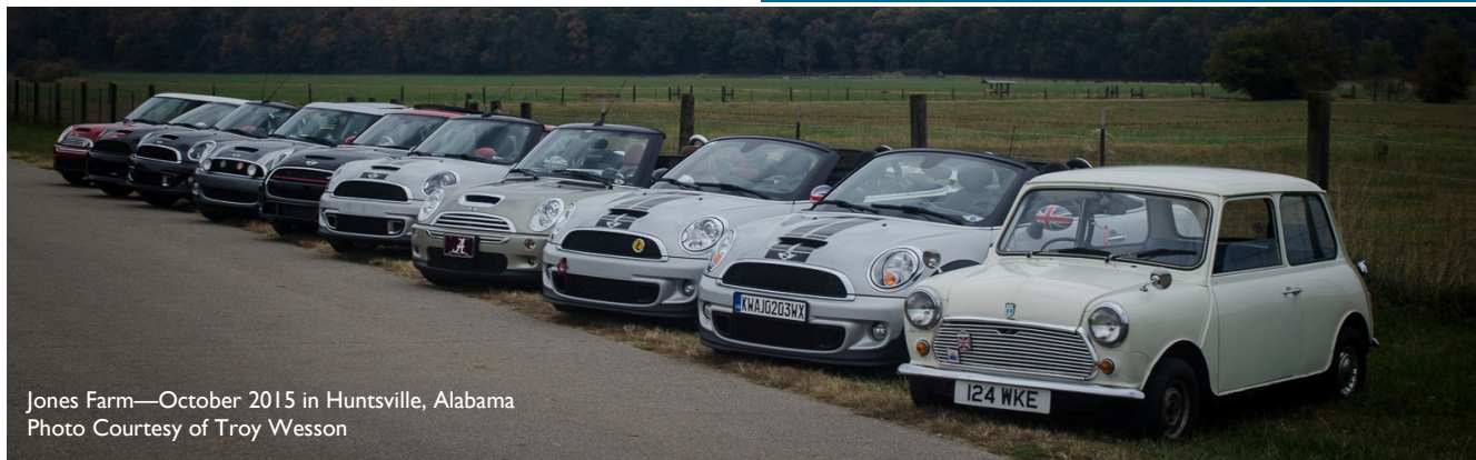
Jones Farm—October 2015 in Huntsville, Alabama

Facebook tends to have the most current information for events.