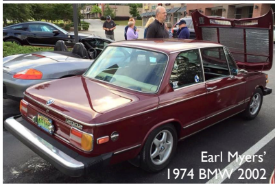
Earl Myers' 1974 BMW 2002