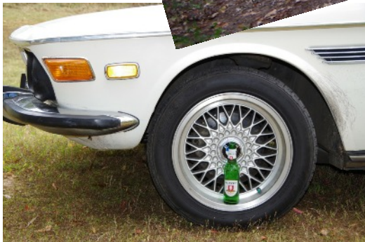
The only beer for a 2800 CS