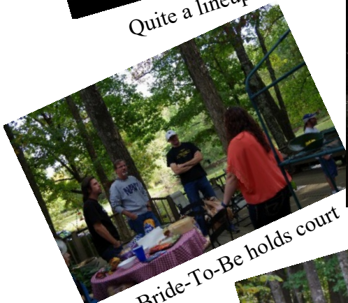
The Bride-To-Be holds court