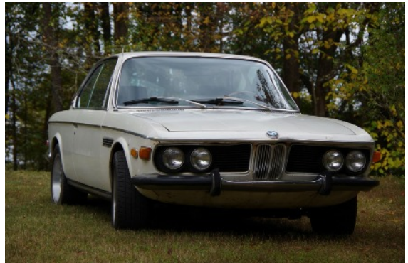
...and the oldest car there.