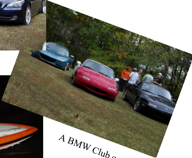
A BMW Club cookout?