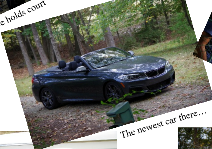
The newest car there...