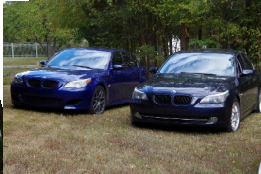
Blues Brother & Sister