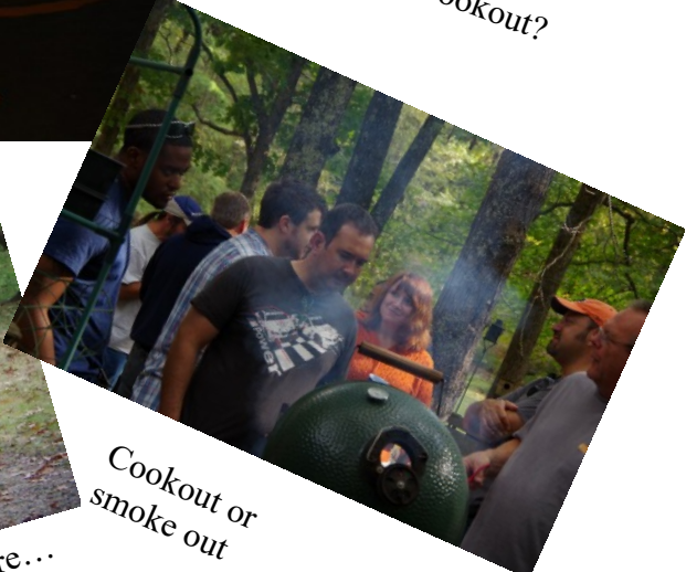
Cookout or smoke out