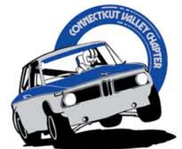
BMW Car Club of America