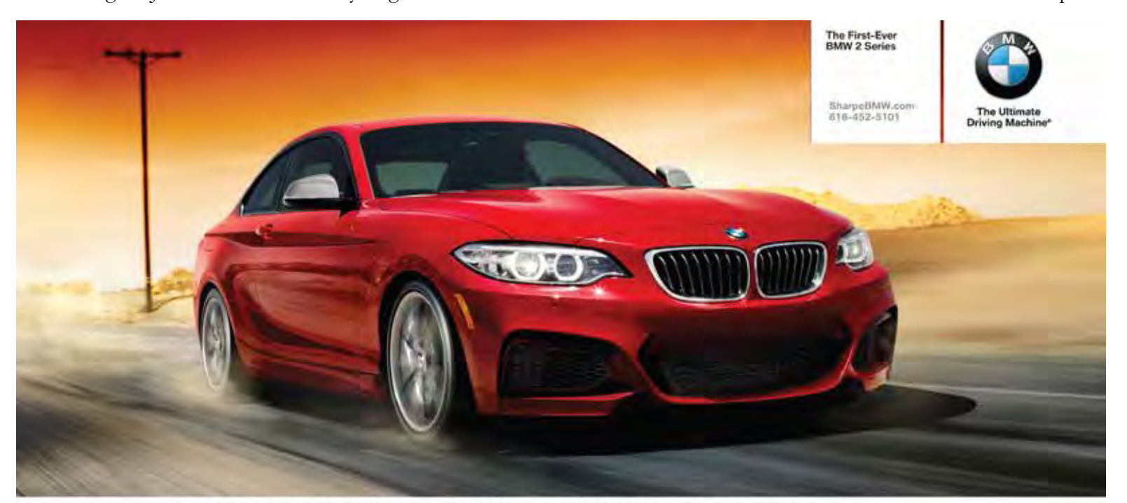
There's one in every family. And in ours, it's the first-ever 2 Series Coupe. It may be BMW's youngest powerhouse to date, but with a hard-hitting inline six-cylinder engine and 320 horses, it's anything but the runt of the litter. Somewhere between 0 to 60, you'll see what we mean—in just 4.8 seconds.*

We also want to give a huge thank you to Eve Dolenski for 6 years of dedicated service to the chapter as treasurer. Treasurer is one of the more active board po-