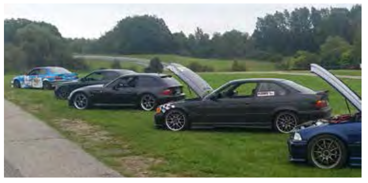
Grattan is one of the most picturesque tracks I have been to, the first time I pulled in I thought I was at a golf course!

I'll see you at the track in 2016 - NeverLift!