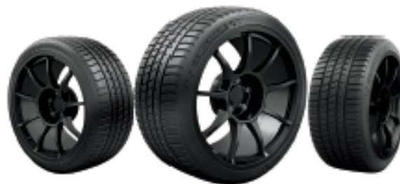
MICHELIN® Pilot® Sport A/S 3

324 West Cherry Street Milwaukee, Wisconsin 53212 414.273.1000