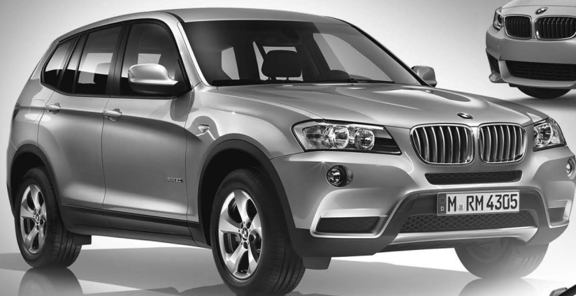
The BMW X3 SAV.