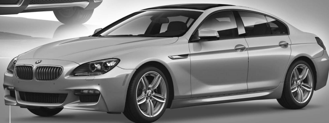
The BMW 6 Series Gran Coupe.