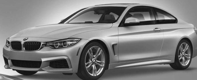
The BMW 4 Series.