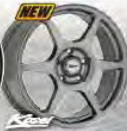
Kosei K6R 15 17