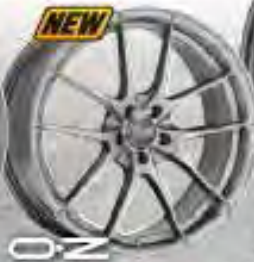
O.Z. Racing Leggera HLT 17 18 19 20