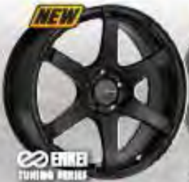
Enkel Tuning T6S 17 18