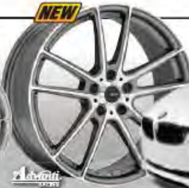
Advanti Racing Drago 18 19