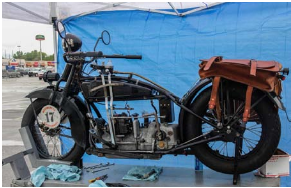
bottom right: A dry place to work