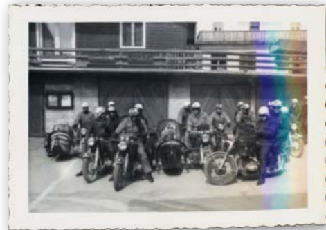
top: Club sports activities in the 1960s. bottom: Club tour in the 1960s.