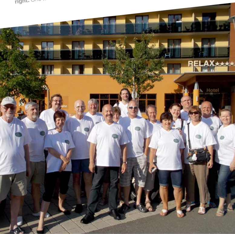
left: 60-Years-Anniversary Week 2014, Kreischberg/Styria. right: One week's time out in Tuscany.