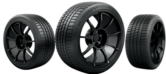
MICHELIN® Pilot® Sport A/S 3

324 West Cherry Street Milwaukee, Wisconsin 53212 414.273.1000