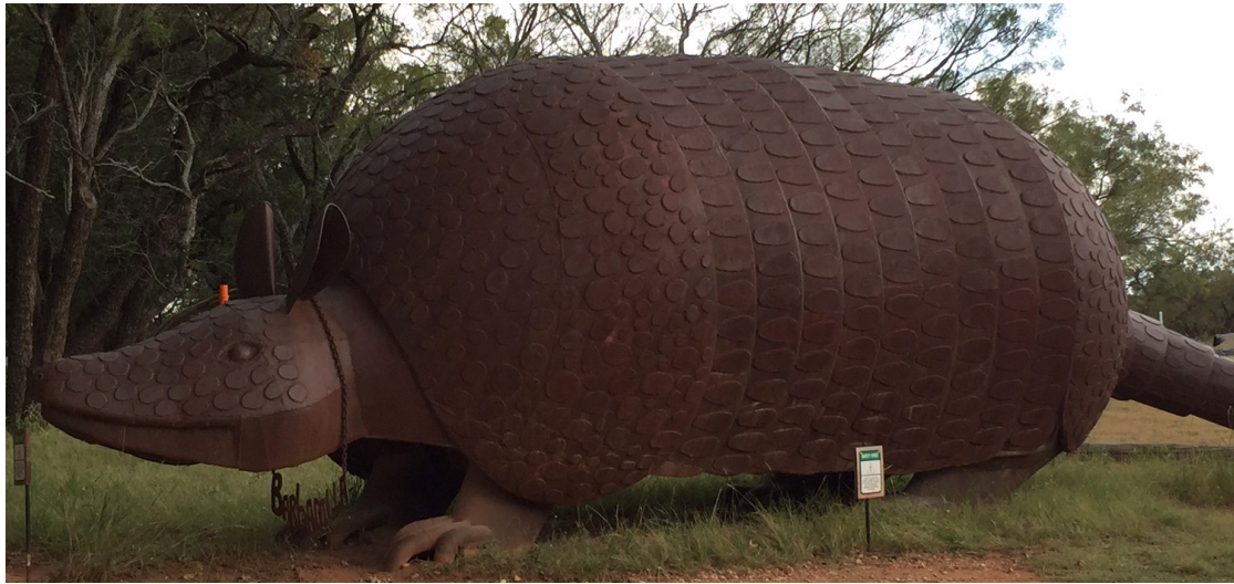
Figure 2. Perini Ranch Armadillo

For our 2017 tours, we're thinking of calling one of our events our "cultural" tour. Maybe 2017 we'll head down to Waco for the day. We are definitely working to finalize our 2017 schedule and we currently have 4 out-of-town tours that we hope you'll consider joining us on. There will still be plenty to do in town, so watch for those dates.