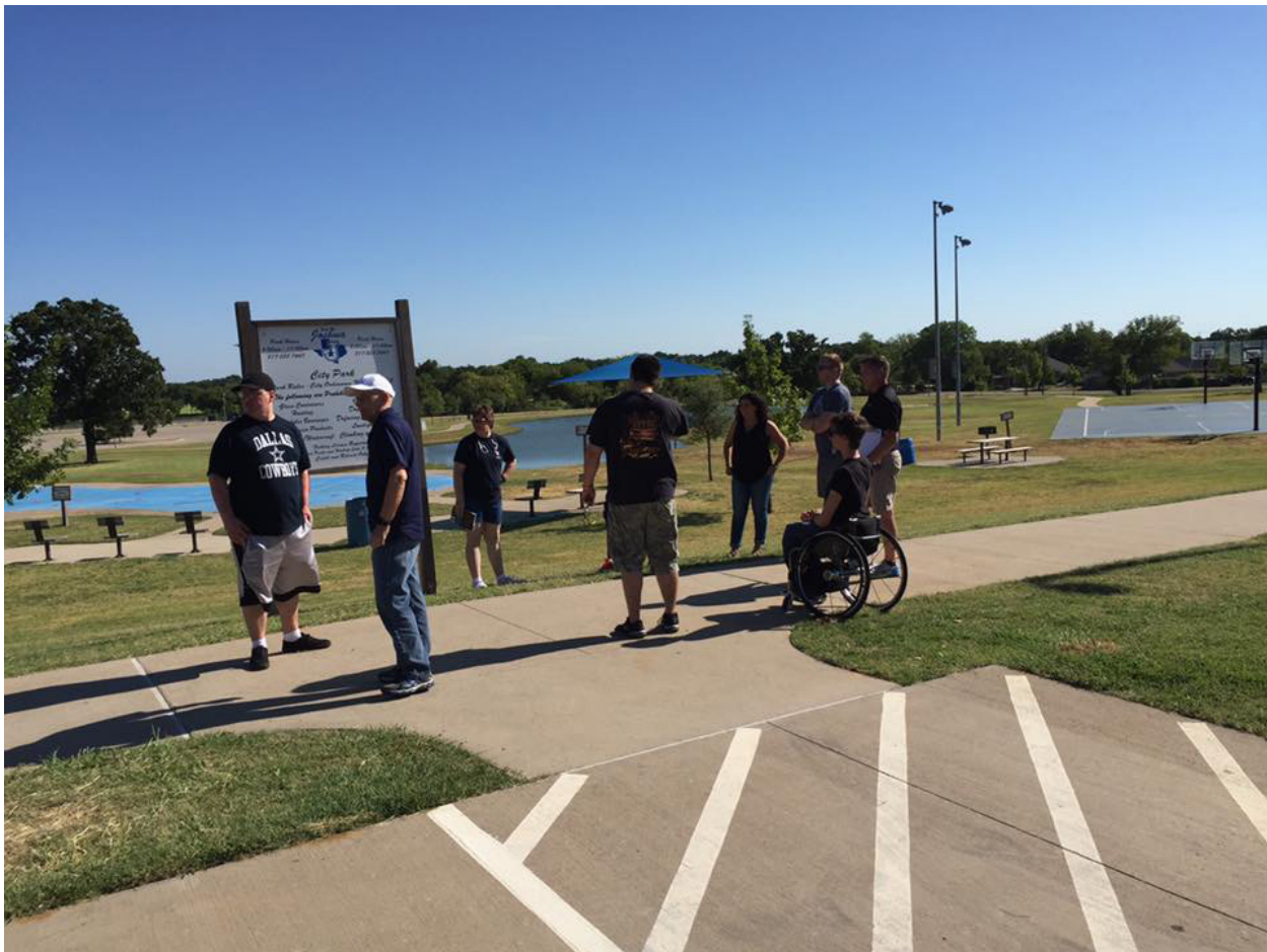
Smiles on everyone's faces as we exit the gathering place