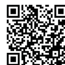
Detailed OCC Explained Video