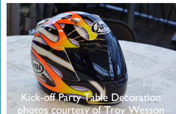
Kick-off Party Table Decoration