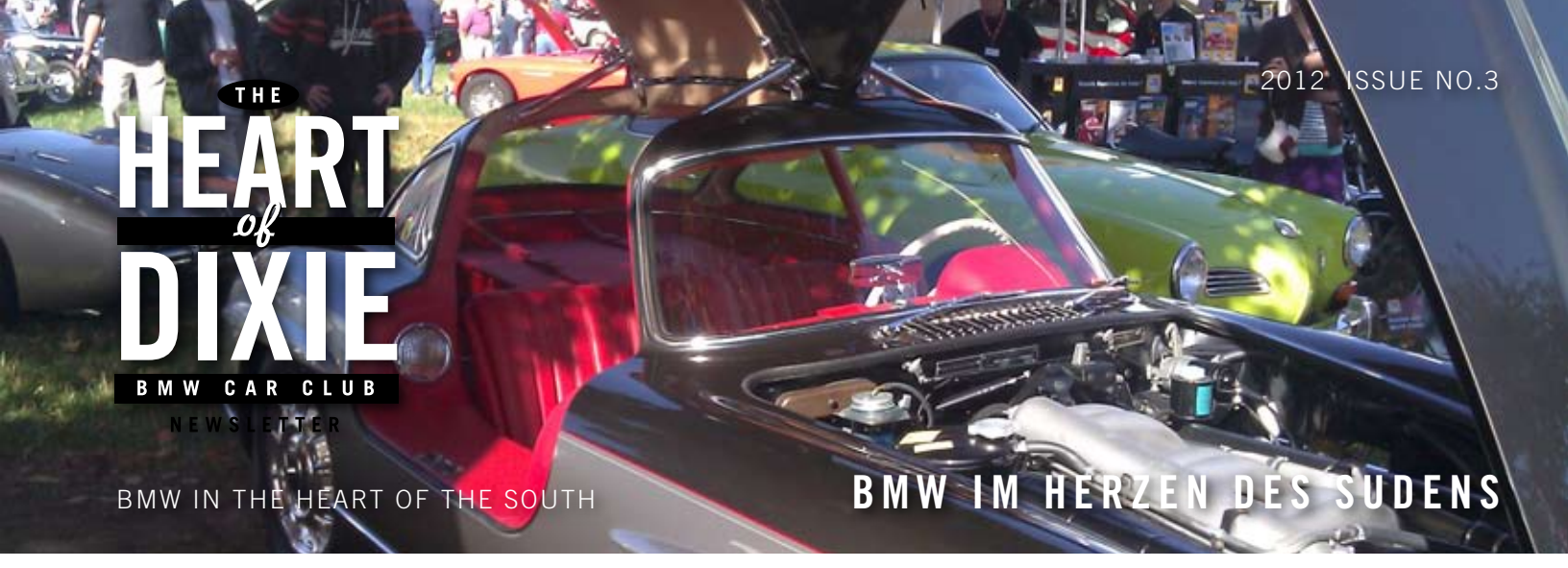
Above: A scene from the Euro Auto Festival in Greenville, SC.