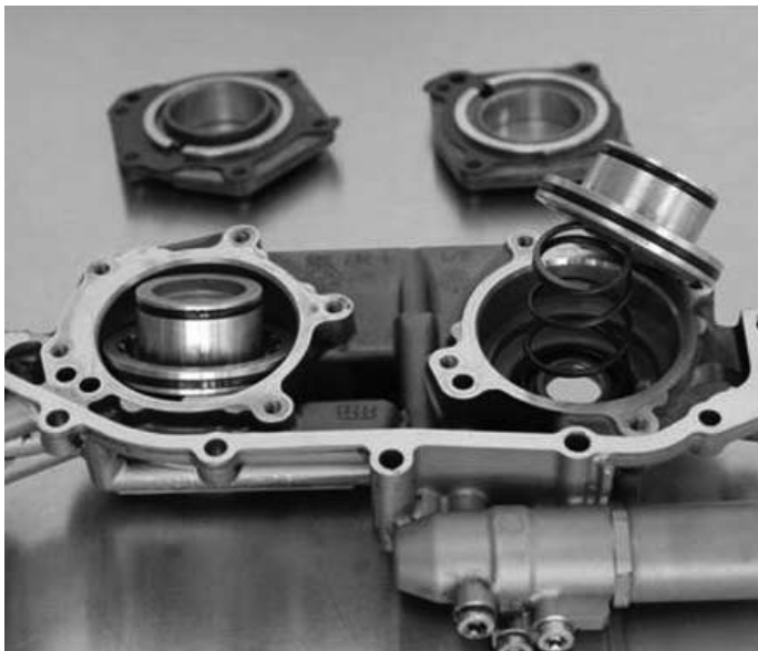
Above, Dual piston VANOS shown disassembled. Note: spring goes on the right as shown.

Once the seals get brittle they can't hold the oil pressure and won't move in their cylinders. You would think somebody at BMW might have thought about this since valve cover gaskets only last about 60K miles and appear to be made of the same material – it's not rocket science.