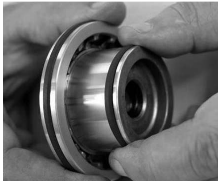
Above, on piston assemblies, O-rings need to be replaced to fix the VANOS.

At left, removing the access plugs from the VANOS system. A dual VANOS is shown. If you have a single piston VANOS, you'll need cam jigs to hold the cams in alignment while making the repair.