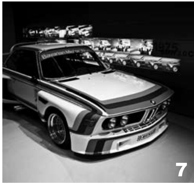
An iconic racing legend of the early and mid-1970s, the BMW 3.0 CSL. Its nickname “the Batmobile” was attributed to its avantgarde areodynamic styling, but fly could it too. (see pages 7-9)