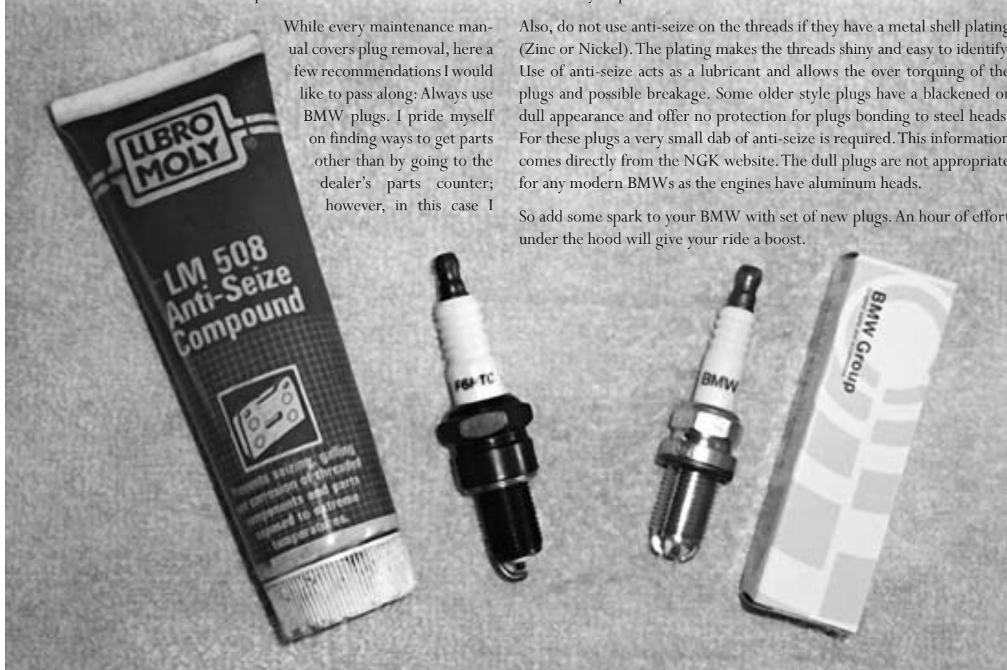
If the threads shine, they are just fine. If the threads are drab, give them a dab.

So add some spark to your BMW with set of new plugs. An hour of effort under the hood will give your ride a boost.