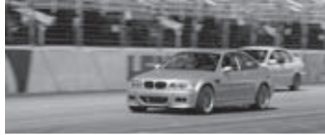
High Performance Driving School at NHMS.

High Performance Driving School This three day school at NHMS is your last chance for track time this year. This is a joint event with the Boston Chapter, who will be hosting the event this year. COST: $225 per day Register NOW! (until 10/14/12)