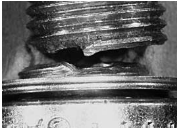
Detail of an overtorqued and subsequently broken plug. Notice the anti-seize on threads.

While every maintenance manual covers plug removal, here a few recommendations I would like to pass along: Always use BMW plugs. I pride myself on finding ways to get parts other than by going to the dealer's parts counter; however, in this case I