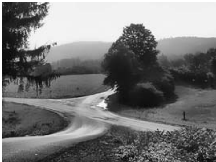
Which way now? Your choice.