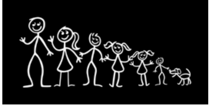
A joy to the person behind the wheel. A killjoy to the person behind the rear bumper.

But I am NOT a hamster! I am Steve McQueen and how dare you hold me up! When approaching a vehicle from behind, if the back window shows those generic stick-like figures of the family and animals... Warning! If the vehicle is a Subaru station wagon... Warning! Danger! If it is a pre 2010 Buick... WARNING! DANGER! Expect speeds below the posted limit or less, brake lights often and the ad-nauseum blinking turn signal that is no indication the vehicle will be going that direction. I can feel my blood pressure rise and start with a call to the almighty, "Please God, make them turn off at the next road." And when passing said road without a turn, there shall be name calling... OUT LOUD, followed quickly with physical signaling and finally the flashing of headlights.