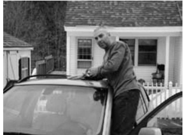
The author implementing a temporary fix with a roll of... Well what else?! - Duct tape.

The X3 seemed as watertight as a U-Boat through the winter. Apparently ice and snow on the roof don't quite have the potential to penetrate into