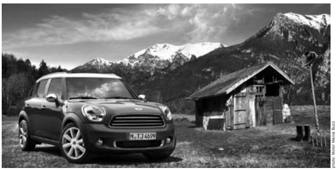
The MINI Countryman - a wonderful orange grown in Austria.

here is a new Utility Vehicle in the BMW family and it comes in the form of a MINI. As most people reading the Profile know, MINI is owned by BMW so any news on that subject is of at least some consideration for the greater BMW CCA audience.