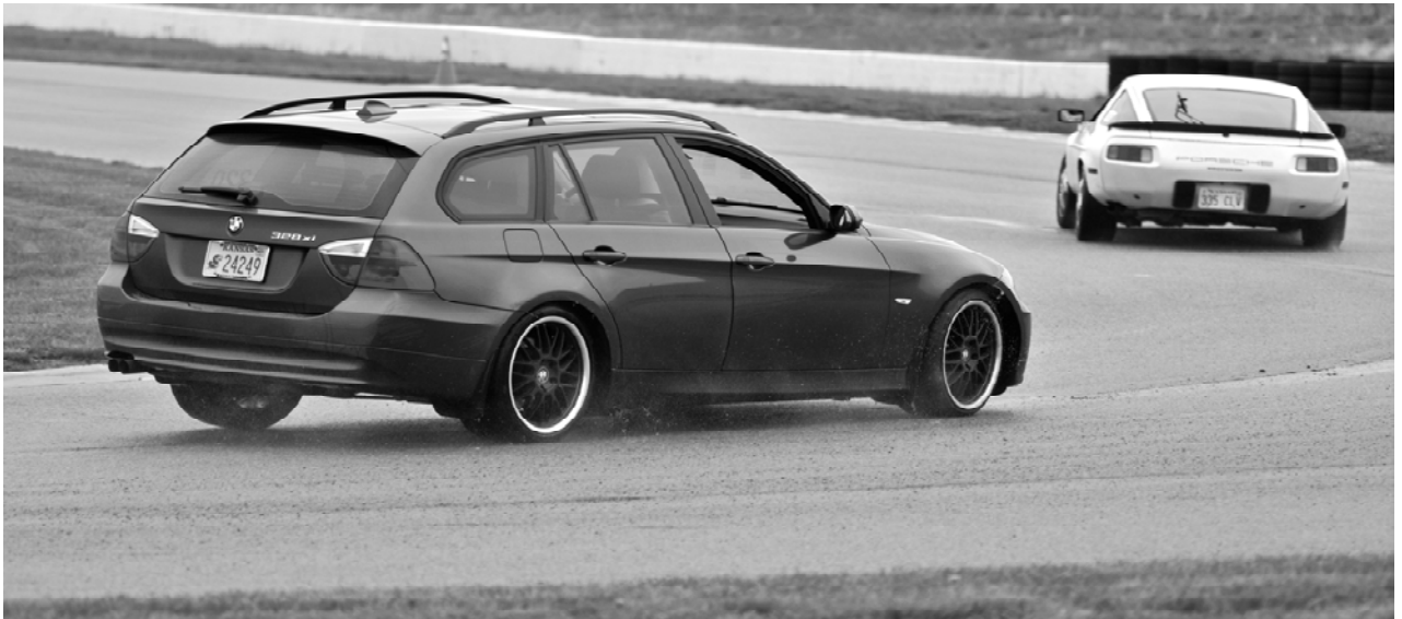
You can do the HPDE in just about anything; a 328xi might have an advantage on wet pavement.