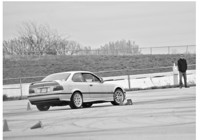
Autocross area at Heartland Park.

FOC had the entire hotel next to the track booked for the weekend, and on Friday night the management rolled out the red carpet. Attendees were treated to free hamburgers and all the fixings while folks got to know each other, or in the case of many attendees, reacquainted. Saturday night there was a BBQ at the track, along with a track "walk" (via bus), and a straight line "autocross" for charity. Despite rain and cool weather on Friday and Saturday, I didn't talk to anybody the whole weekend who wasn't thoroughly enjoying themselves. As my first BMWCCA event outside the local chapter, it was a great experience both for the driving opportunity and meeting new friends.