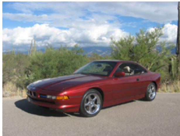
Bill Jaramillo's 1992 850i

For the third year the annual Cops and Rodders car show was sold out with a near-record 620 vehicles. I have been to this event only once in the past, as the club but have to say this year's event was just perfect - weather, people & cars. There were 15 cars total in the BMW category, which more than filled our club's promise of 10 cars.