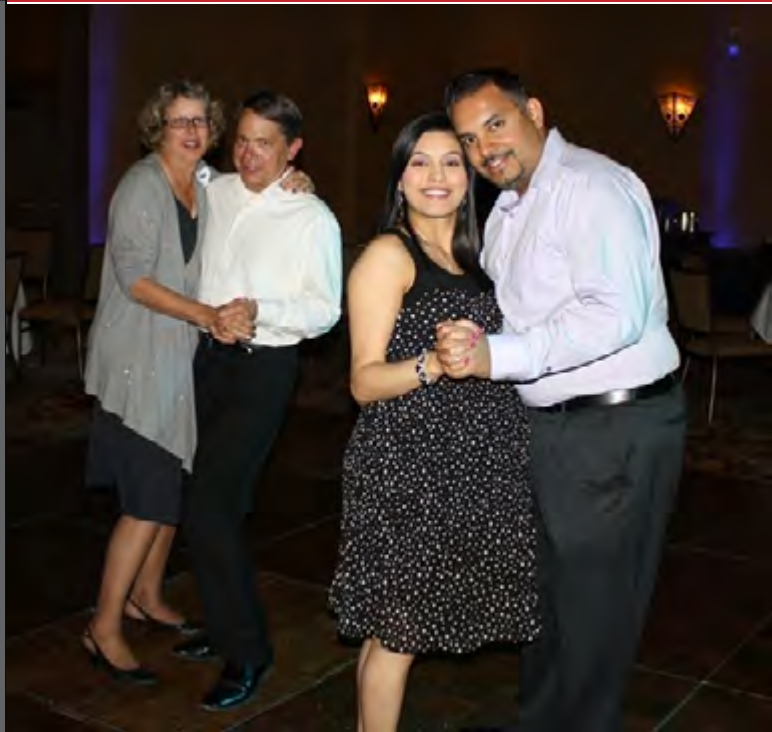
The 2012 dinner held at the Hilton El Conquistador was a great time with friends, good food, music and dancing. Click image for slide show.