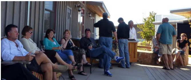
Being served at Helwig – what a treat!