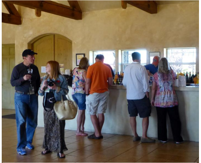
Tasting at Karmere