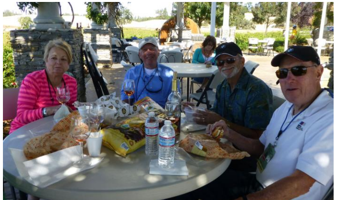
Picnic lunch on the patio at Karmere