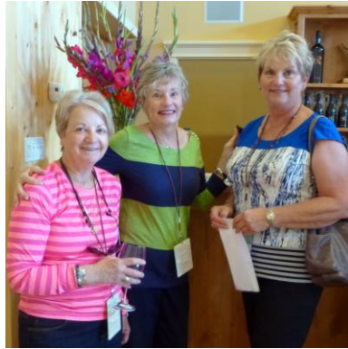
Tasting wine with chocolate is such a pleasure!