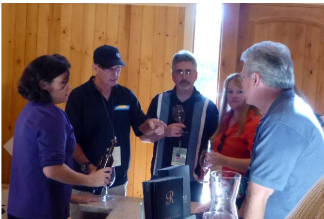
Enjoying a great red at Jeff Runquist