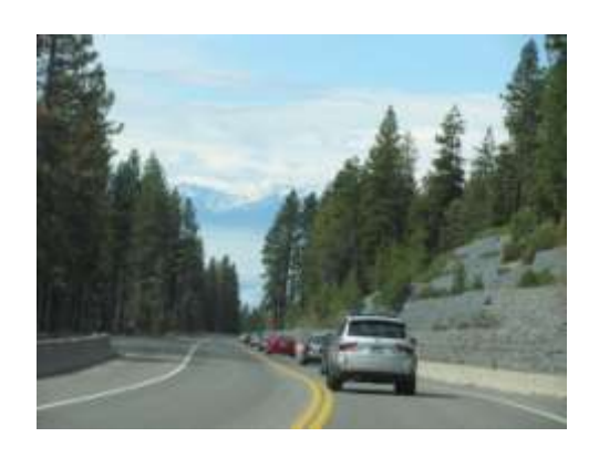
It's always fun to drive over Mt. Rose Highway to Tahoe! The weather on Saturday the 21<sup>st</sup> of May cooperated nicely.

For the latest pictures and news about the club, go to www.sierrabmwcarclub.org