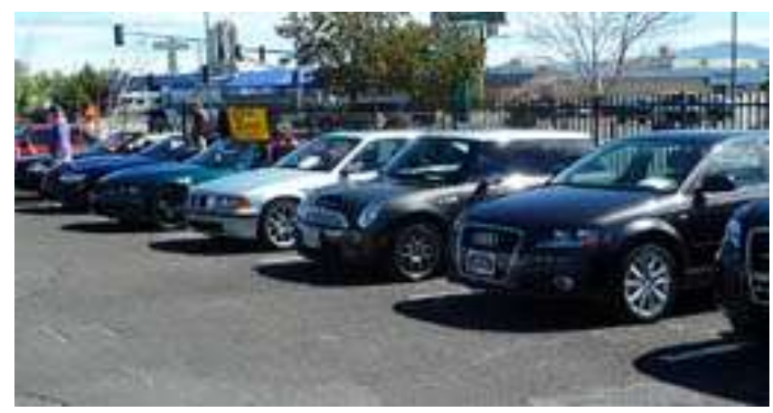
Our annual Charity Show & Shine is scheduled for Saturday , September 24 . Be sure to put this one on your calendar!