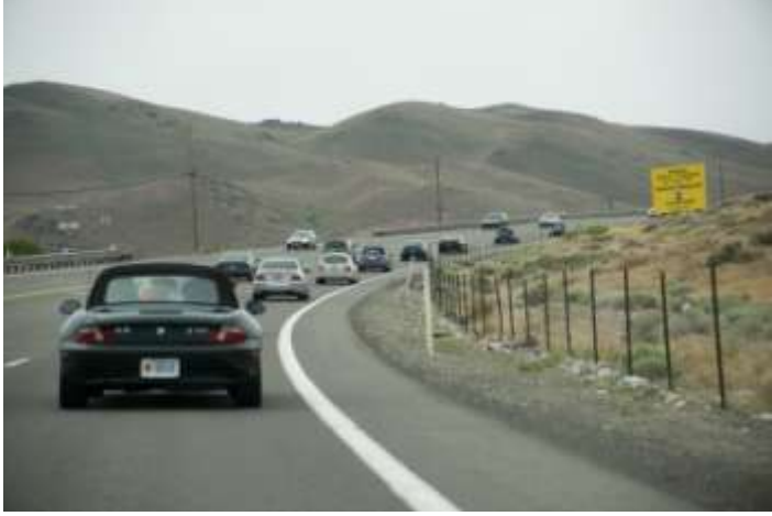
Genoa Tour and BBQ, June 4.