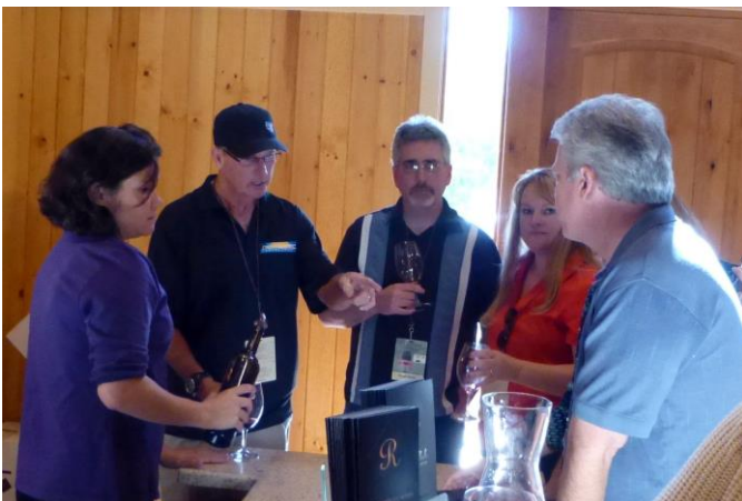
Enjoying a great red at Jeff Runquist