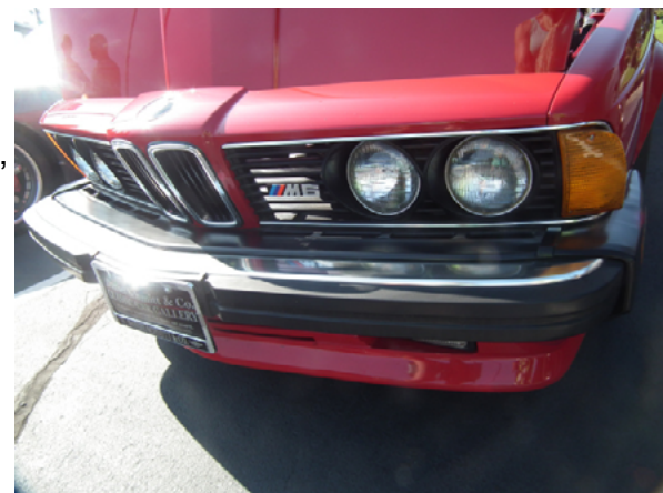
Old School Six Series Style