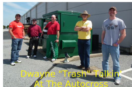
Dwayne "Trash" Talkin' At The Autocross