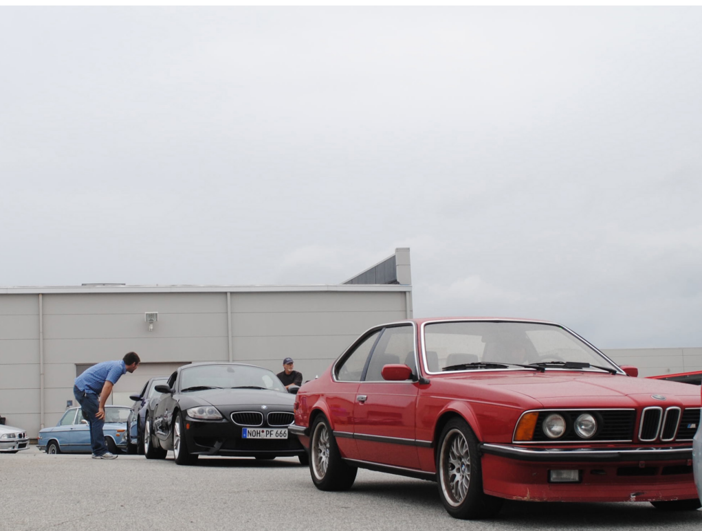
Sandlappers lining up for a practice lap at the June, 10 Autocross.