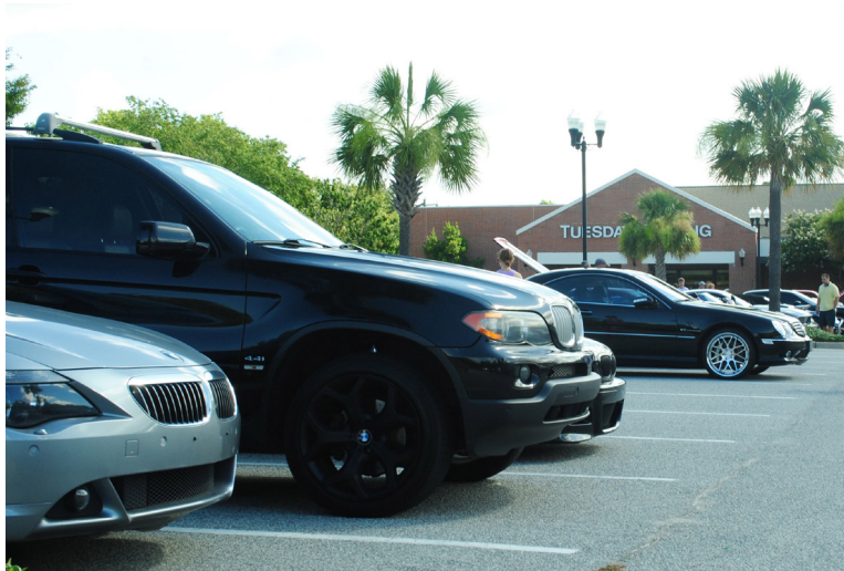
BMW representation at the Mount Pleasant Cars and Coffee in July.