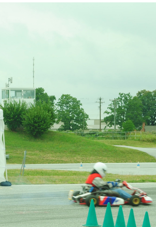
...e, since all participants must be using a ...s its the M.25 mDrive13p* *p denotes plutonium fueled vehicles