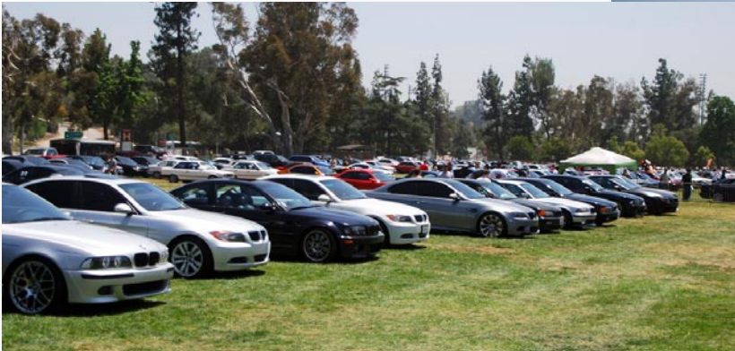
Thousands converged on Pasadena to be surrounded by amazing BMWs.