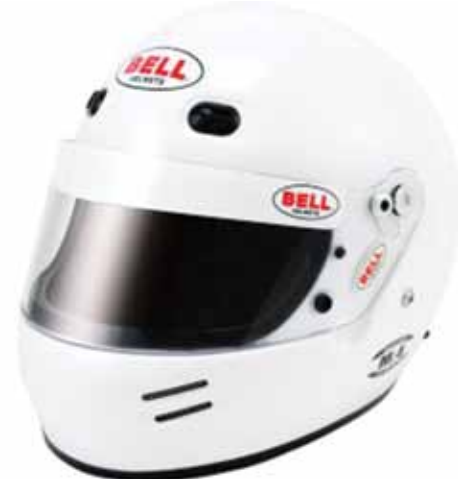
The Bell M.4 is an aggressively styled, multi-featured helmet that can be used in all forms of racing. The M.4 features the largest size range of any Bell model and is available in sizes XXS to 4XL.