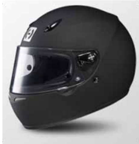
This HJC lightweight helmet has a fiberglass shell construction. Meets or exceeds SNELL SA2010. Plush, removable & washable Nomex Interior. Double D-ring retention system. Advanced ACS ventilation system. Pre-drilled for Hans.