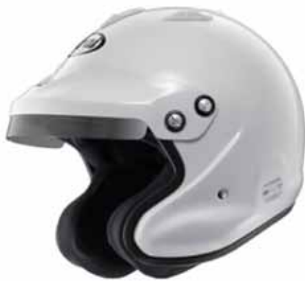
The Arai GP-J3 is Arai's newest open face auto helmet. The simple and smooth lines of the Arai GP-J3 mask the complex energy management system beneath the brand new shell.