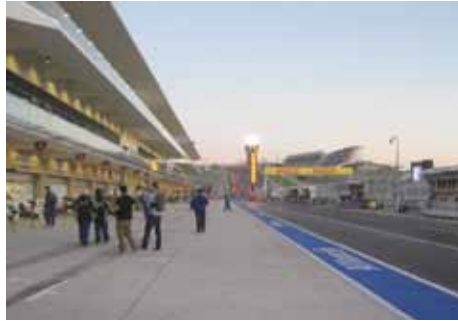
Early morning paddock walk viewing towards Turn 1.

After briefly unpacking, we boarded the worker charter bus and headed to the registration/welcome dinner. At registration I learned: 1) we were assigned $300 multi-layered race suits that we were 100% responsible for returning or we'd be given an invoice, 2) we had assigned black COTA baseball caps and black COTA golf shirts to wear that we could keep, 3) we were assigned USGP F1 bibs that we could keep, and 4) I knew more people than I realized—some people from Runoffs at Road America, some people from San Francisco Region, as well as some others from Northwest Region! All in all, there were 350 marshals approved to work the USGP in various capacities.