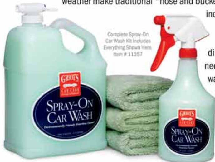
Complete Spray-On Car Wash Kit Includes Everything Shown Here. Item # 11357

dissolves road grime, so you can safely wipe it away; no rinsing needed. Great for road trips, winter cleaning, or replace your traditional washing and use it year-round! Come see us today in Tacoma, pull your car into our Free Car Care School, and we'll show you how!