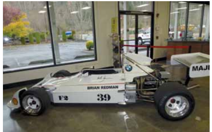
BMW Formula 2 Car.