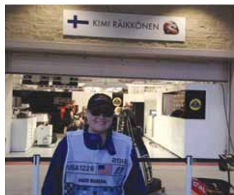
The author in front of the Lotus garage.

down the paddock area to take garage pictures—seeking out Kimi Räikkönen’s garage for some quick pictures. I also made a quick stop in one of the two start/finish stands along the front straight. I honestly geeked out at the technology and made a commitment to myself that I will somehow be in that stand for a F1 race someday.