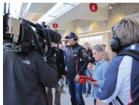
Mark Webber speaks to the media.