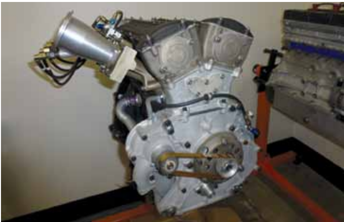
BMW Formula 2 Engine.