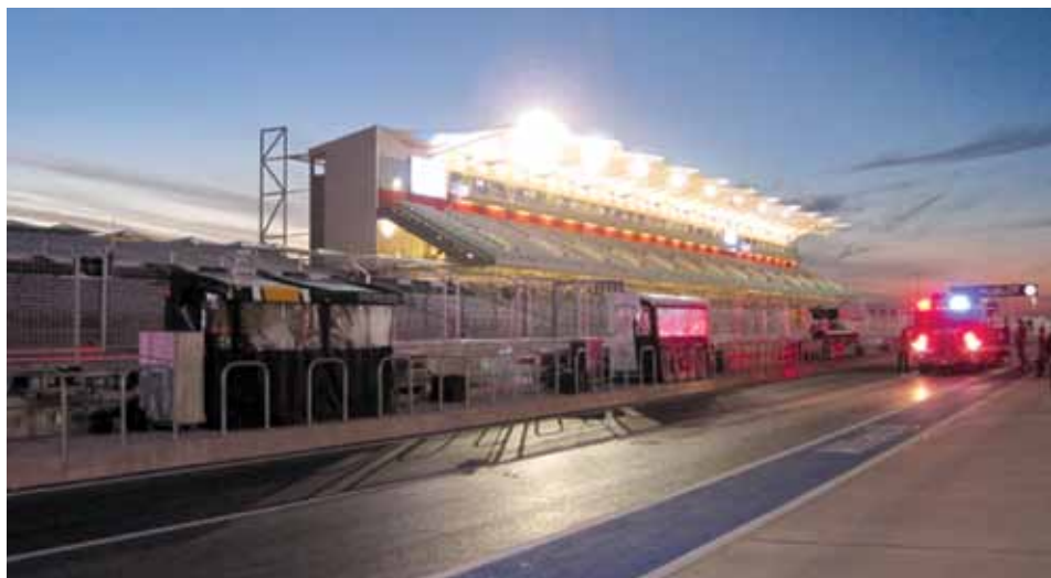
Sunrise at Circuit of the Americas.

This was also the day I struck a deal with my Chief Post Marshal to head out to the vendor area in an attempt to buy race gear and a program. From my turn, it was a seven minute brisk walk. Once out in the breezeway, I waited for