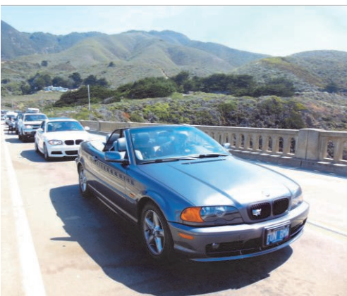
FUN BMW on the road