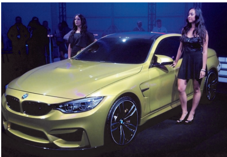
Above: the new M4; Top: a line of Alpinas from 1967 to present

through the famous redwood tree and instead reflected on the good times spent and the new friendships made. CCA Oktoberfest/Legends/Pebble Beach was truly a bucket-list trip – driving with friends, sharing stories from the road, looking at cars you almost never get to see, and exemplifying what a membership in any car club is all about... driving. Next year's O'Fest will be in the Rocky Mountains of Colorado. Take it from three first-time O'Fest attendees: you need to be there!