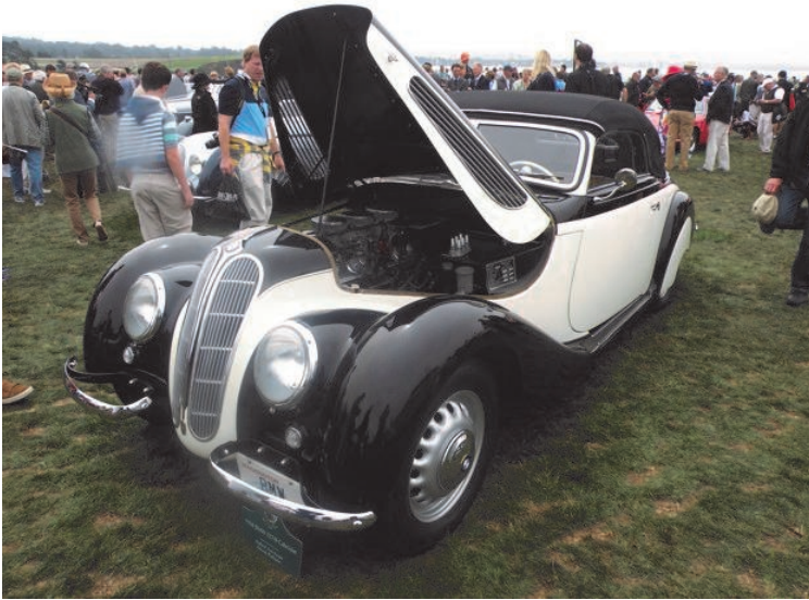
Cars & Coffee like no other.

Because we had driven to O'Fest rather than trailering our cars, we had no expectations of winning any concours awards, but that did not stop us from taking the necessary time to prep our cars to compete. We represented the Oregon chapter well. In a previous paragraph,