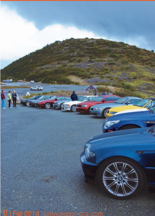
6 | Fall 2013 | bmworegoncca.com

Right: Kidney beans in the rain Below: A gray day indeed