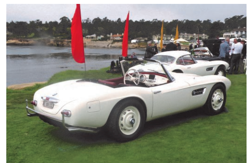
Elvis used to own this 507