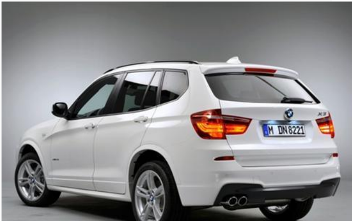
New X3 is driving BMW's growth in the US

Chris Woodyard writes in USA Today that Mercedes-Benz's lead over BMW has dwindled. Declining demand for some older models and the cost of introducing new, smaller cars will make it tough to rebuild that premium in 2012.