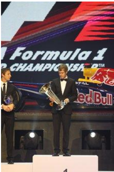
After a year of triumphs Sebastian Vettel's closing reward

The 2011 FIA Formula One World Champion collected the coveted trophy from FIA President, Jean Todt, while Red Bull Racing team principal Christian Horner was presented with the 2011 Constructors' Trophy by Bernie Ecclestone. Jenson Button and Mark Webber also received awards for second and third places respectively in the drivers' championship.