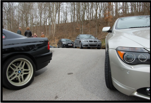
A little break from some spirited driving