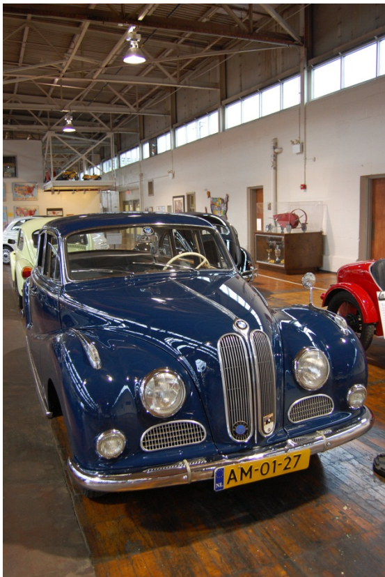
One of the many beautiful cars on display at the museum