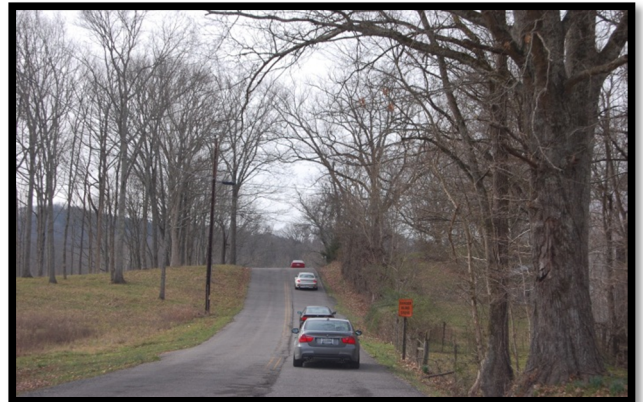
Back on the road and headed to Mary Jo's Mealhouse