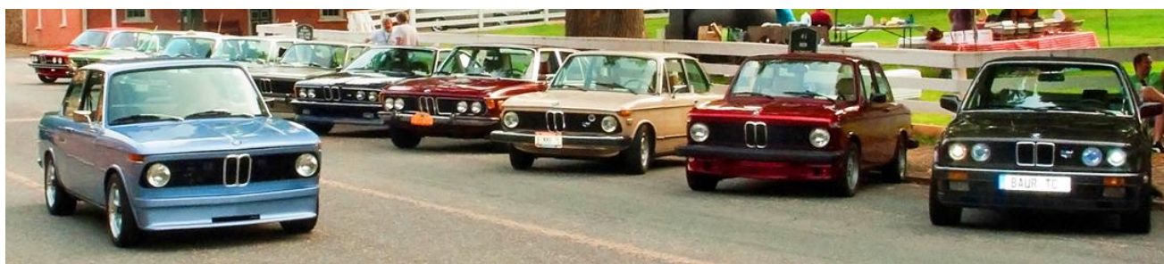
No sign of stress here. From David Yando's account of Vintage in the Vineyard—see page 4.