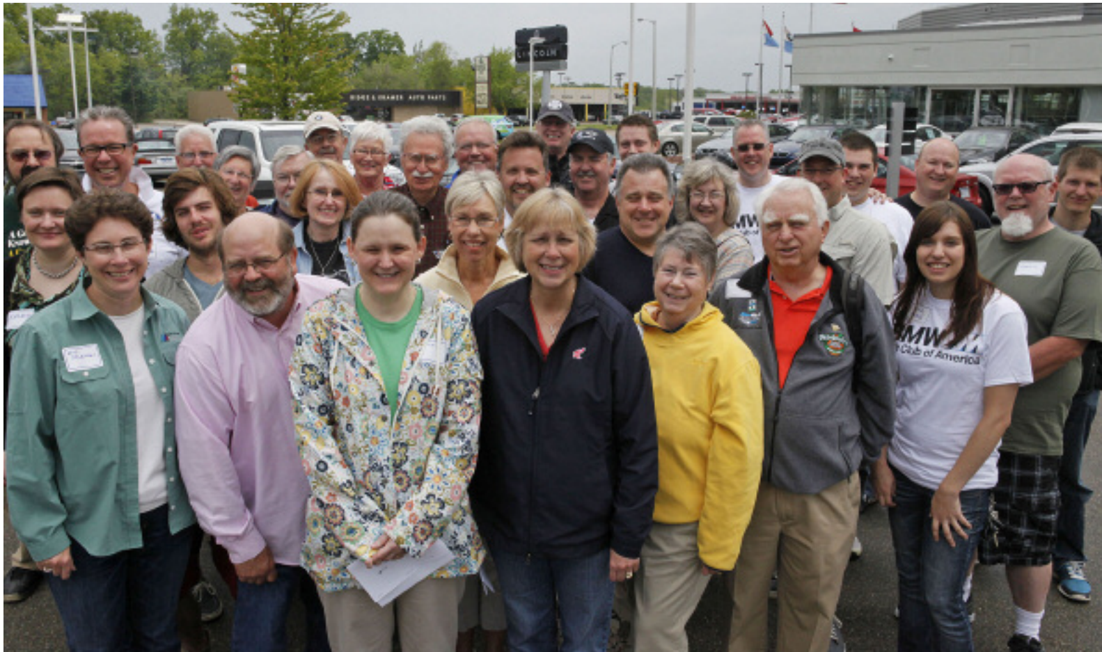
Lots of smiles on this year's Spring Dust Off cruise, beginning at Zeigler BMW in Kalamazoo on May 12.