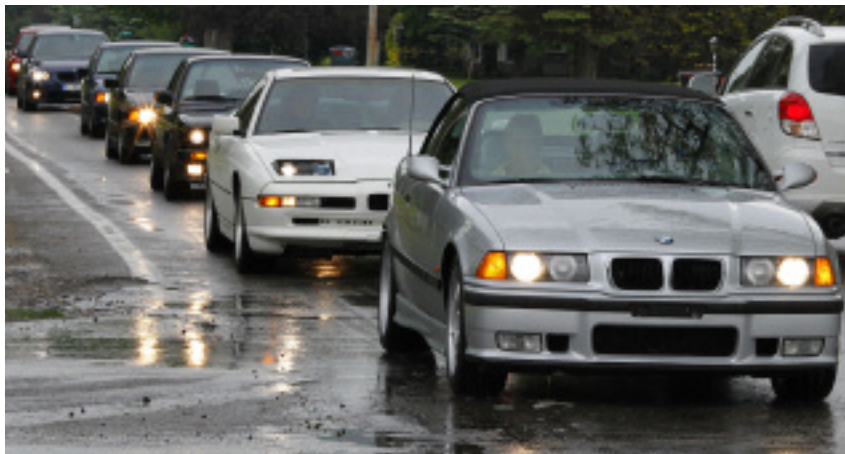
A bevy of Bimmers in the spring drive. Don't miss the Fall Color Tour, scheduled for Oct. 13. See cover for info.