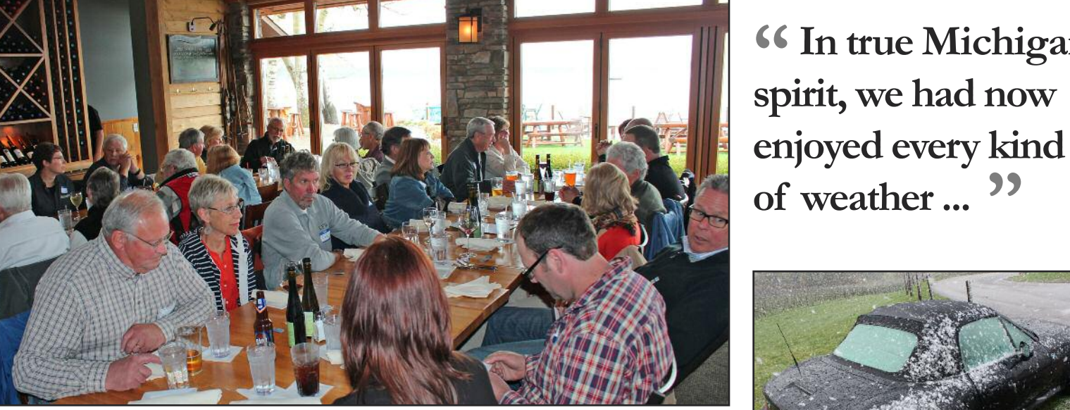
The Apache Trout Grill featured an excellent meal and Grand Traverse Bay views.

Blackstar Winerv's lot. our Michiana Bimmers.