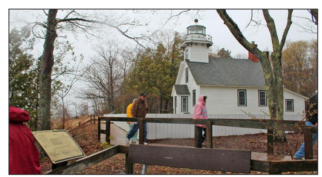
Tour members visit the Old Mission Point Lighthouse, located on the 45th parallel.

We are delighted to have enabled more of our members to experience a Michiana Chapter outing. Our goal was to try to reach into an under served part of our membership area and provide an opportunity for some of our members that can't make it to the events that are held in Grand Rapids, Kalamazoo, or South Bend.