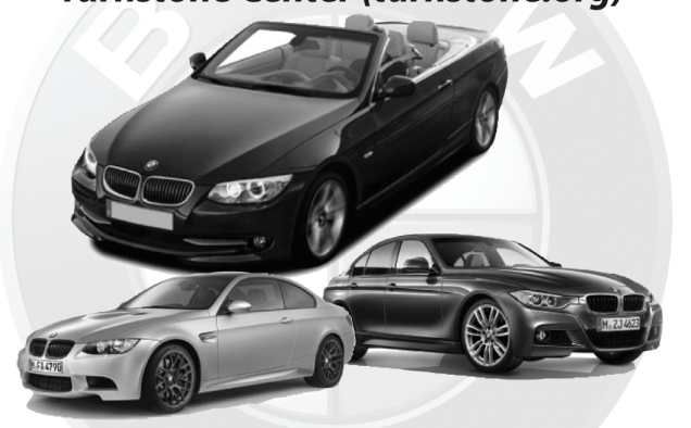
Refreshments & Voting for best "Classic" BMW from 12-3 First 50 to pre-register will receive a gift.

10% Discount on Parts & Service for Club Members