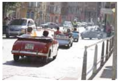
In the streets of Manresa.