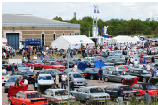
The largest gathering of BMWs in the world at our National Festival.

Many special events are being organised this year to help mark our 60 years, including the first UK Z-Fest to be held at Silverstone Classic in July and in August at our National Festival, now the biggest gathering of BMWs in the world, in August.