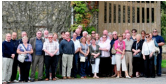
Our group stops for a photo outside a Champagne producer in the French village of La Neuville aux Larris.