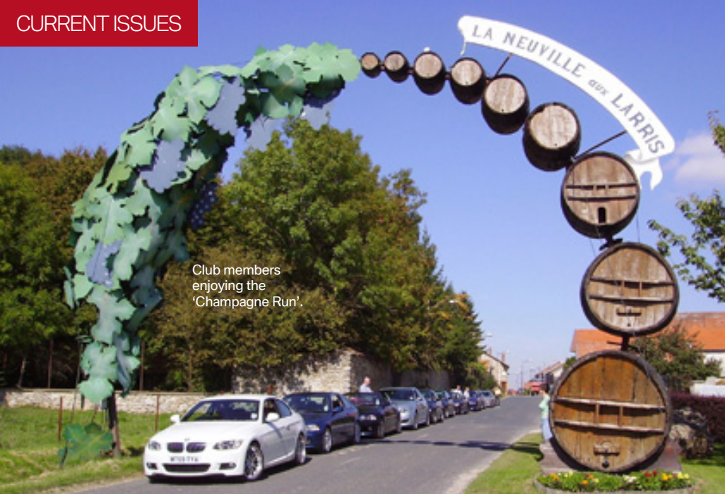
Club members enjoying the 'Champagne Run'.