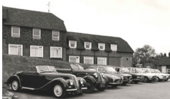
A BMW Car Club GB meeting in the 1970s showing a real mixture of BMW models, from a 1937 BMW 327 to a then new E12 520i.